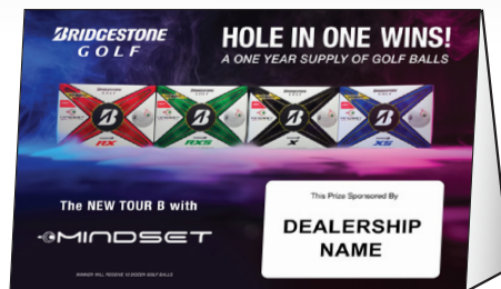
One Year Supply of Golf Balls ($600 Value)