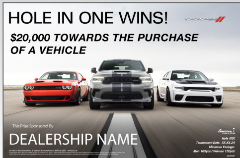
2' x 3' Personalized Main Prize Sign