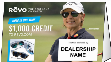
$1,000 to Shop Revo Sunglasses