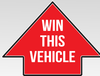
2' Arrow Sign