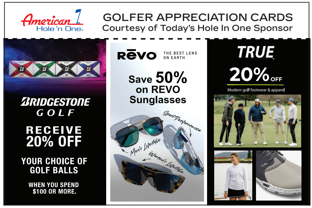
Available for US Events Only

The program incentivizes each participant at the event to register to receive a valuable spend with quality brands, courtesy of your hole in one sponsorship. Cards are handed out at registration for each player to scan the QR Code to redeem these exclusive offers to premium golf and lifestyle brands. All this is fully funded, and at no cost to you.