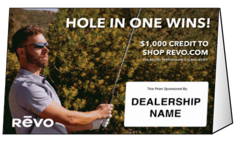
$1,000 Credit to Revo Sunglasses