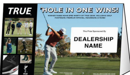
$750 to Shop TRUE linkswear