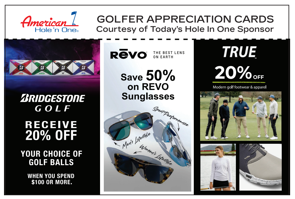
Available for US Events Only

The program incentivizes each participant at the event to register to receive a valuable spend with quality brands, courtesy of your hole in one sponsorship. Cards are handed out at registration for each player to scan the QR Code to redeem these exclusive offers to premium golf and lifestyle brands. All this is fully funded, and at no cost to you.