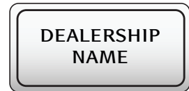
12" x 24" Vehicle Cling With Every Event You Sponsor

FREE CONTESTS AND PRIZES FOR EVERY ADDITIONAL PAR 3