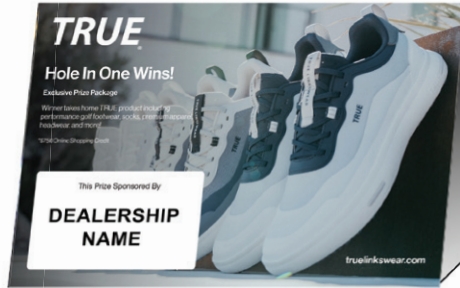
$750 to Shop TRUE Linkswear