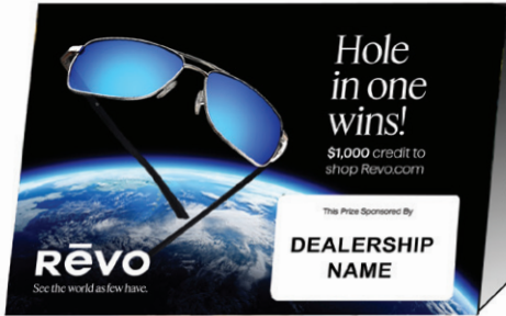
$1,000 Credit to Revo Sunglasses

2' x 3' Bonus Prize Signs Prizes and signage subject to change