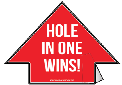
2' Arrow Sign