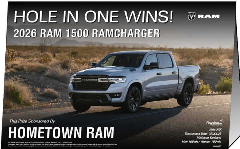
2' x 3' Personalized Main Prize Sign