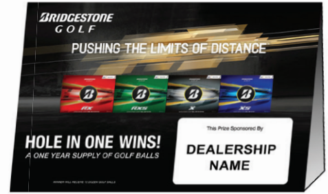
A One Year Supply of Bridgestone Golf Balls